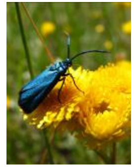
Zygaenidae Pollanisus virid

The nice thing about this time of the year is there are not too many flies making their way about and annoying the ardent photographer. There are, however, many other insects worth looking out for and one such actually posed nicely for this picture.