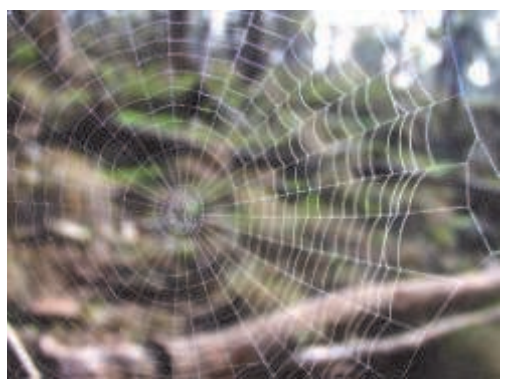
As long as it is relevant to the Brisbane Ranges, it will be perfect.

Now for a challenge & until next issue. Guess what this is: