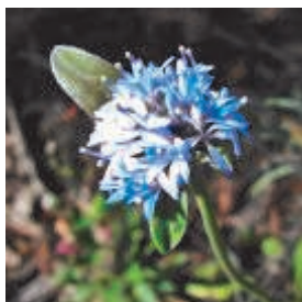
Brunonia australis (Blue Pincushion)

I have been watching for various insects which inhabit our ranges and found two very interesting caterpillars. Neither of these are familiar to me and if anyone has IDs, please let me know.