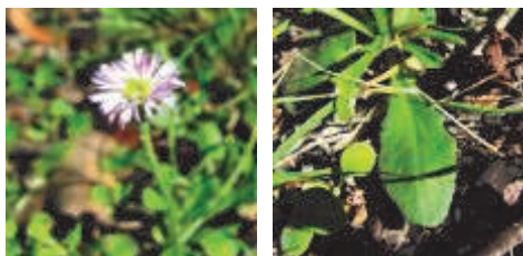
Lagenophora stipitata (Blue Bottle-daisy)

Perhaps even the wildflowers are enjoying the protracted summer but some were a genuine surprise. Here are two spring flowers we found over Easter.