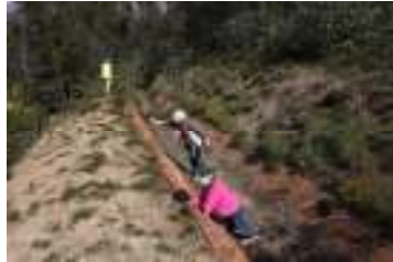
Cook children doing a serious inspection of the Aqueduct condition