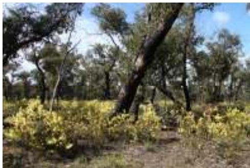
The sea of wattle in flower Grass Tree Track

What a difference a month makes, an almost total sea of yellow dominated the scene, the cycle of fire and then the wet has carpeted this heavily burnt area, much more pleasant to the eye than the fluorescent safety vest colour. After a safety assessment and the usual jokes about the danger of young boys with sharp implements it was time to issue the troops with weapons of mass lopping and cutting and chemical warfare agents for two adults.