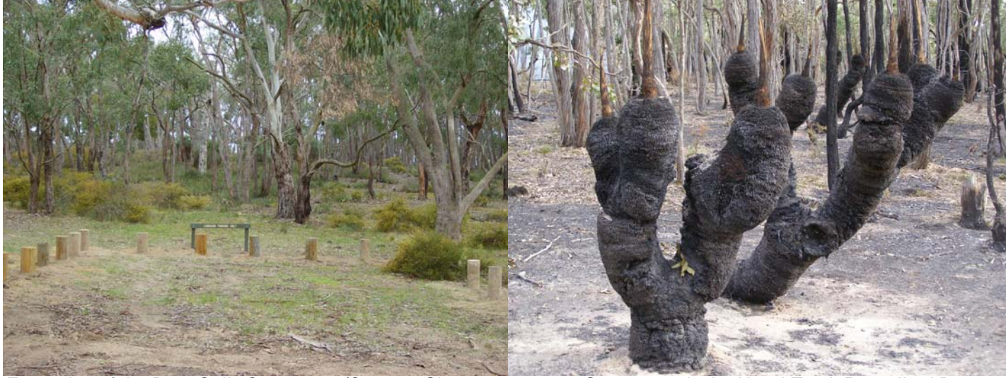
Expansion of the Boar Gully Campervan/Caravan Site