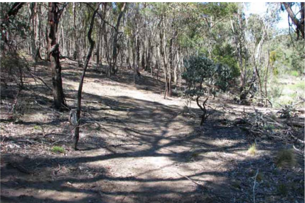
Proposed route from intersection of Back Track and Graham's Creek

We followed the track as best we could along the creek. Trying to spot the route was a guessing game at times, and there were several spots where more than one track was visible. The track was also very steep in one spot, adjacent to the block of private land. The track condition was quite poor and would not currently be suitable for people carrying overnight packs.