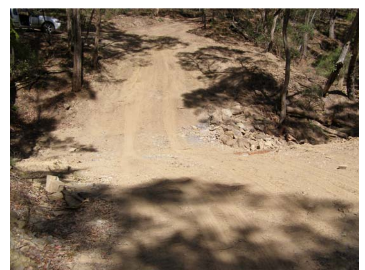
Re establishment of the Red Ironbark Tk Crossing