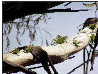
Manna Gum with first epicormic growth exactly 4 weeks after the fire