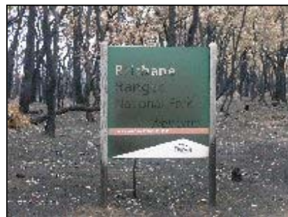
Brisbane Ranges sign - cnr Butchers Road 29/01/06

On another matter, I've recently been burrowing through the Friend's archives (I know, I should get a social life!). The Friends group will be 25 years old on the 3 rd October 2007. Don't say you haven't been warned!