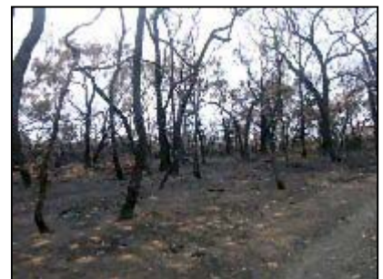
Grasstree track start- 29/01/06